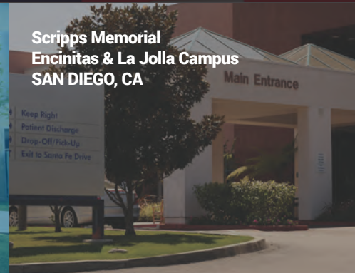
Scripps Memorial Encinitas & La Jolla Campus SAN DIEGO, CA