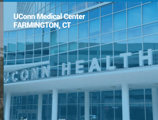
UConn Medical Center FARMINGTON, CT

Valet, Stacking & Golf Cart Shuttle Operating Since 2011