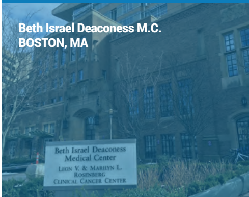
Beth Israel Deaconess M.C. BOSTON, MA

Garages (10), Surface Lots (8) & Valet (7) Operating Since 2005