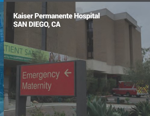
Kaiser Permanente Hospital SAN DIEGO, CA

Self / Valet Parking Operating Since 2007