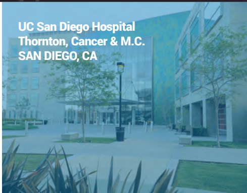
UC San Diego Hospital Thornton, Cancer & M.C. SAN DIEGO, CA